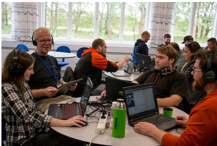
Figure 4. Introducing iPad and headsets