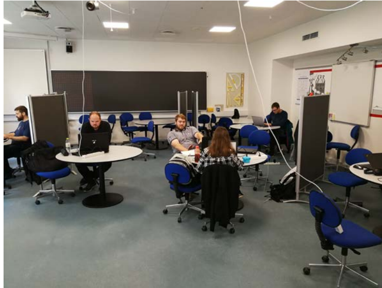
Figure 3. Introducing partition walls as noise-dampening material