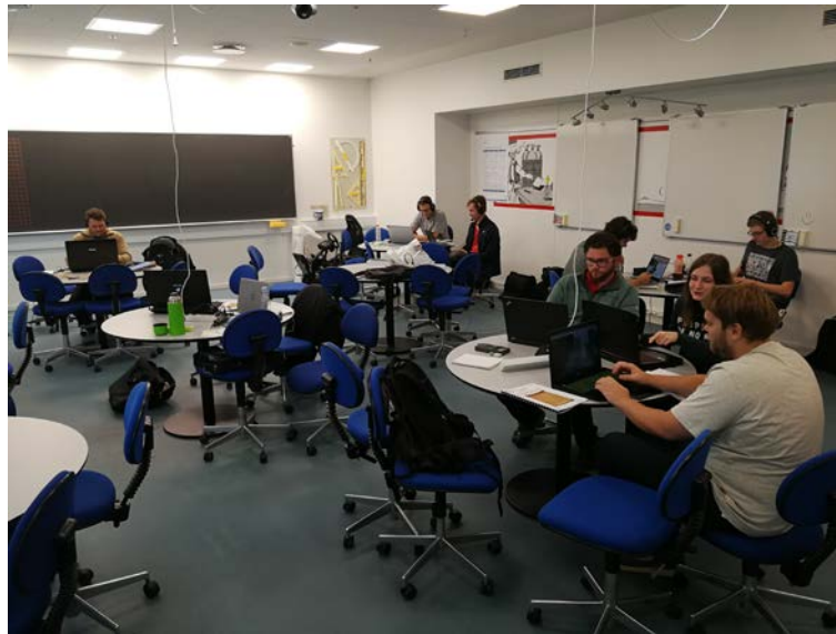
Figure 2. Students seated at the round tables

From 2015 to 2017, the learning space was not well established; the physical setup in the classroom was still traditional rows of tables and chairs, facing the lecturer sitting at a desk. Although the students were divided into teams based on their Insights profile (Insights Discovery, 2019) and the statement from the CDIO Syllabus report (2001) (“Graduating engineers should be able to conceive-design-implement-operate complex value-added engineering systems in a modern team-based environment”), the students sat randomly in the classroom. In addition, not all team members were represented in the classroom, and as a result, the lecturer could not support the students team by team. Starting in August 2018, it was therefore decided to reorganise the classroom, seating the students in their teams at round tables in small ‘table islands’ (see Figure 2 below).