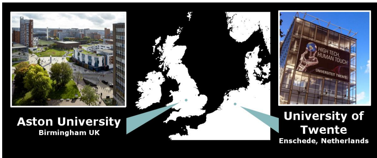
Figure 2 : Aston University and the University of Twente

Aston has been a CDIO member for around 8 years and has a curriculum which features significant levels of project based learning.